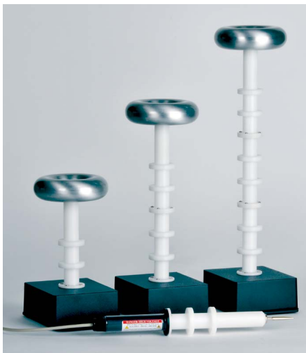
HVL Series High Performance Lab Grade, HV-SmartProbes™ shown above in 35KV, 70KV and 100KV models. Handheld HVP-35 portable HV-SmartProbes™ shown with detachable probe tip.

Vitrek's 4700 precisely measures voltages directly up to 10KV, right out of the box—with no external probes. That's high enough for most of the HV sources out there. However, should you care to expand your high voltage measurement range—just add one or more of the available 35KV, 70KV, 100KV and 150KV SmartProbes™. The Vitrek SmartProbes™ each store their own calibration data which is down loaded when they are plugged in to the 4700—this results in high accuracy, calibrated readings and allows any Vitrek SmartProbe™ to be used with any 4700 HV Meter. The SmartProbe's™ proprietary, ultra-low TC attenuator design minimizes self-heating—while its low capacitance technology enhances AC